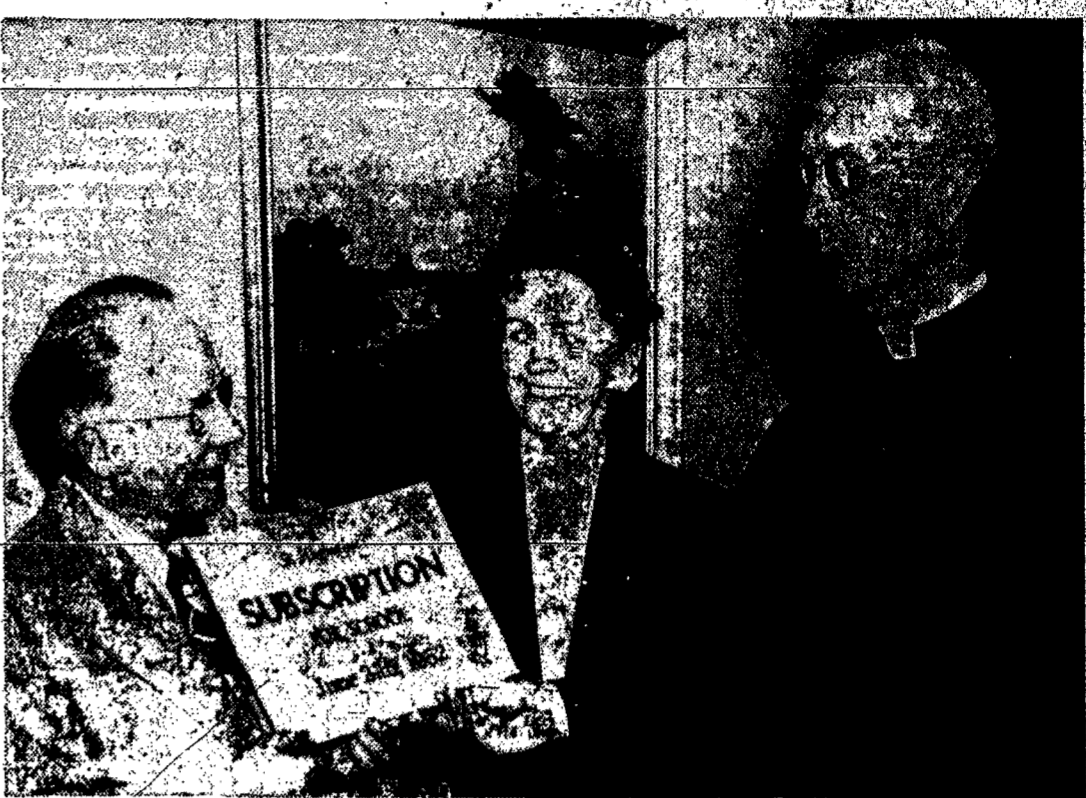
THE GOAL OF $40,000 will be incentive of campaign workers in St. Augustine's parish, Rochester, to pass in fund-raising effort from June 2 to 16. Addition to and revamping of

The only other New York State Schools among the 16 added to the list are the College of St. Rose, Albany, and Sarah Lawrence College, Bronxville.