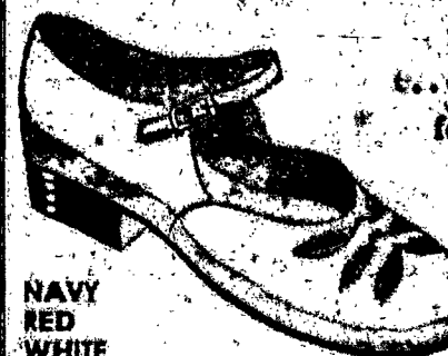
NAVY RED WHITE

We're proud to carry Stride Rites... because we think there are no finer children's shoes than these. We believe in them... in their superior quality and workmanship; in their carefully planned construction. We believe that Stride Rites... exactly fitted by our trained staff... offer your child maximum foot protection throughout the important growing years. Come in soon, won't you?