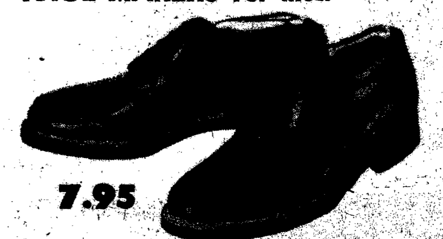
PACE MAKERS for men

Write or Phone HAMILTON 4000 • Order Department Opens at 9 • Sibley, Lindsay & Clark Co.