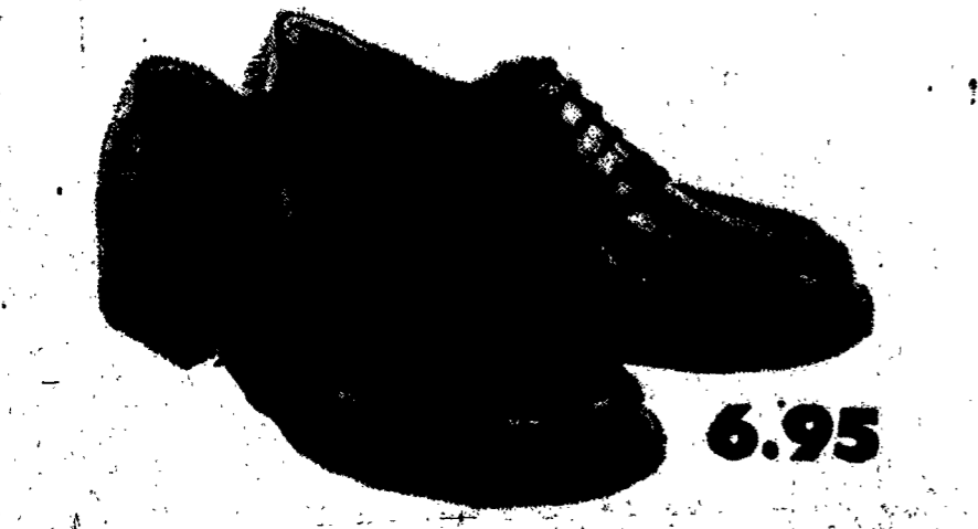
RAND ROCKET JR. for boys