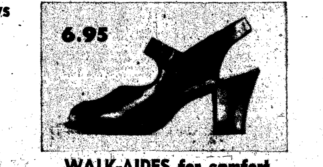
WALK-AIDES for comfort