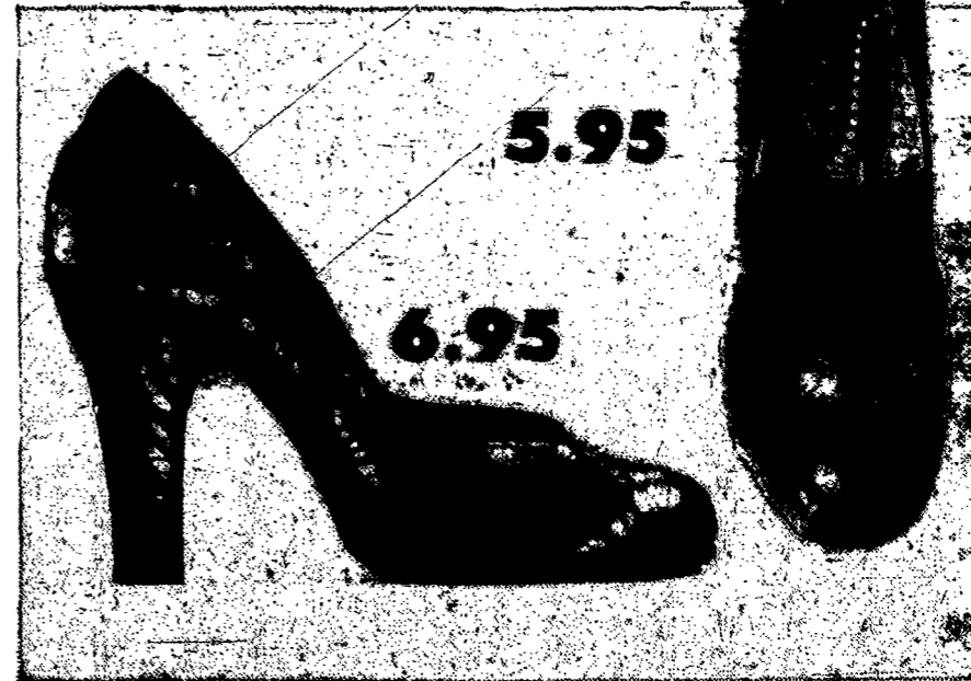
PRETTIES for style