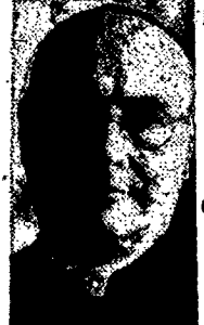
Cardinal Spellman - New York knows that he has a wise and practical understanding of the devotional need of the faithful. It is geared for use in private devotion as well as participation in the official liturgy of the Church, the Holy Sacrifice of the Mass.

Here is a prayer book that should become the most popular of all prayer books with American Catholics, if not the entire English speaking world. In selection of content and technical production it is superb.