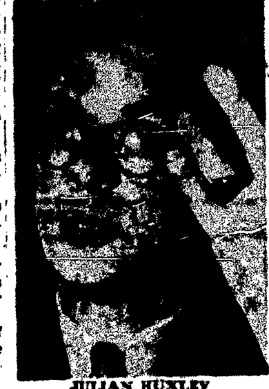
'No Need of God'

"I regard it as a most unfort- are-chosen to carry on the ad- troit.