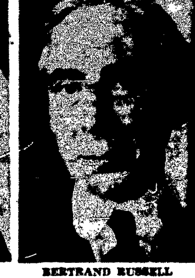
Anti - Christian

the UNESCO history assignment unate action that UNESCO has ministrative work ought to be are described as "atheistic," undertaken a project to write above any suspicion of lack of "agnostic," "Positivist," "Zoross the History of Mankind. This objectivity. Apparently such is proposal has been before UNES not the case in the instance of CO for some time and has met the men who have been put in with little favor on the part of charge. With others, I deplore serious historians because they this situation. see in it inherent difficulties which could wreck the UNESCO ideal and possibly the UNESCO organization.