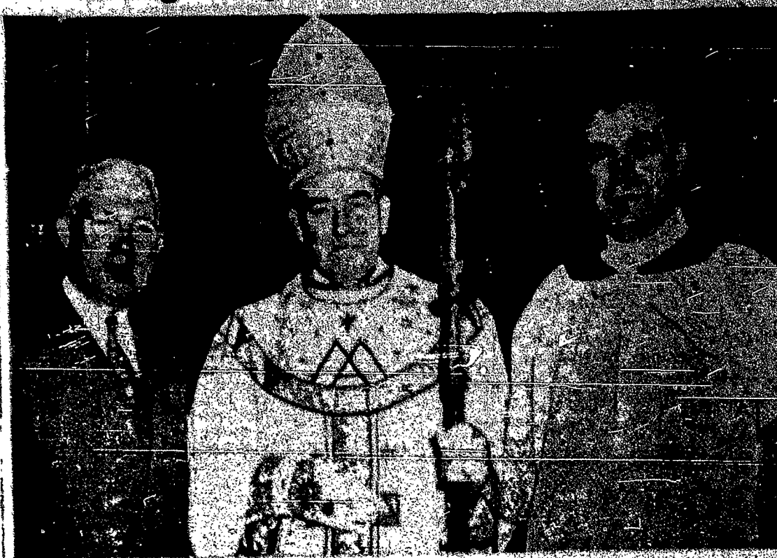
LEADING ROLES in the rally of Holy Name men in the Rochester area Sunday which centered in a Solemn Pontifical Mass in St. Joseph's Church, Rochester, marking the 50th anniversary of the founding of the Holy Name Society.