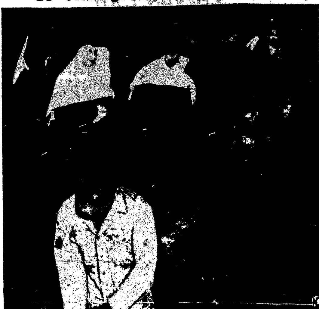
Some 30 soldiers of the Tank Company, 6th Infantry Regiment and of Company C, 759th Military Police Battalion, took time off to go into action with picks and shovels in the American Catholic Community's project to install lights at the convent of the School Sisters of Notre Dame, Marzahnfeld, Berlin, where the American children have been taught catechism the past five years. (NO Photos)