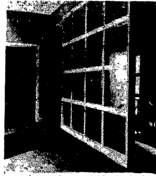
Reception room typifies spacious interior and modern design.

INSPECTION IS INVITED — AT YOUR CONVENIENCE CULver 7660 or BAKER 6273