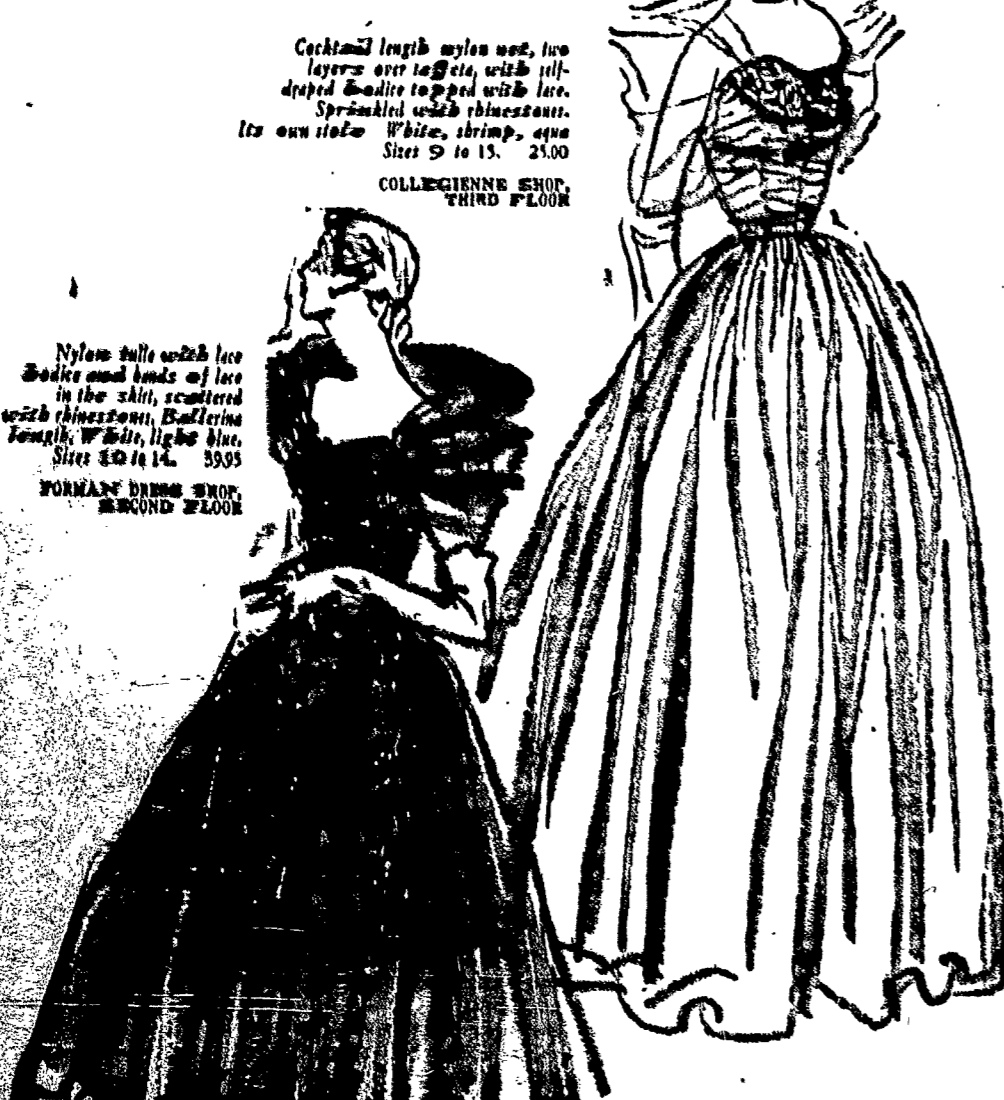
Cocktail length nylon suit, two layers over tulle, with ill-draped bodice to pool with lace. Sprinkled with ribbons. Its own tie. White, shrimp, size 12 to 14. $200

... to fill your Christmas nights with bubbling spirits, snowdrift skirts! Our party dress collections for misses and Collegiennes revel in freshness and newness! See enchantment in lace, frothy plumes, shimmering glitter... the gayest in glamour!