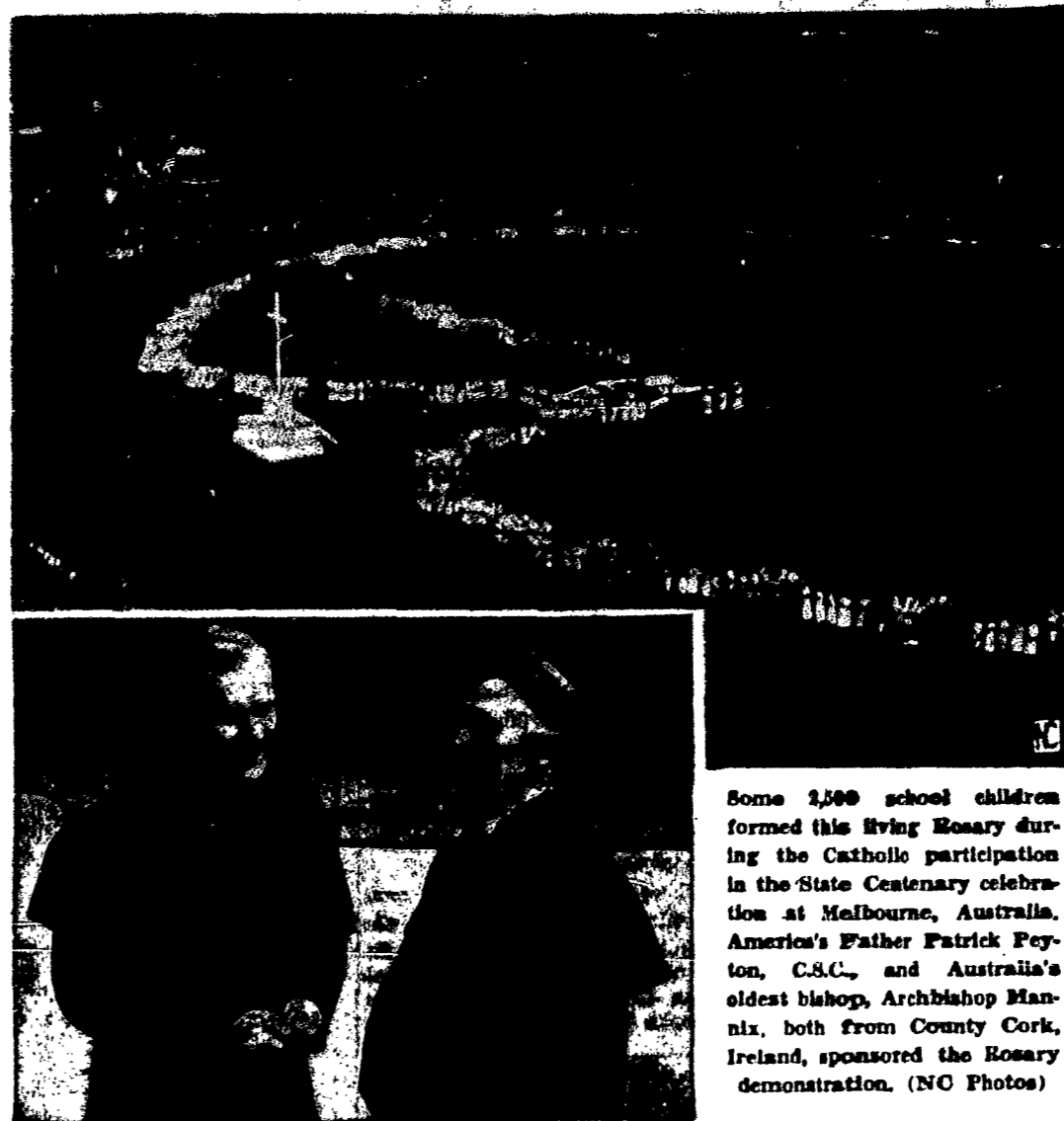
Some 2,000 school children formed this Living Rosary during the Catholic centenary celebration at Melbourne, Australia. America's Father Patrick Peyton, C.S.C., and Australia's oldest bishop, Archbishop Mannix, both from County Cork, Ireland, sponsored the Rosary demonstration.