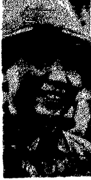
Mao Maps New Purges

The ever increasing pressure which the authorities are bringing to bear for adoption of a "reformed" state-controlled church is primarily on the Chinese priests. Under the guise of patriotism they are forced to attend daily meetings and discussions at which they are definitively instructed to "reform" their church, or else.