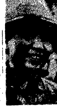
Mao Maps New Purges

The ever increasing pressure which the authorities are bringing to bear for adoption of a "reformed" state-controlled church is particularly on the Chinese priests. Under the guise of patriotism they are forced to attend daily meetings and discussions at which they are definitively instructed to "reform" their church, or else.