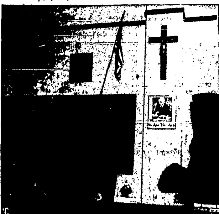
A Franciscan Sister of Mary Immaculate teaches in the classroom of St. Mary's Mission School, only Catholic parochial school permitted in the Canal Zone. Formerly St. Francis Studio, a private language and fine arts school, it was converted into a parish elementary school a year ago.

"The selfless generosity manifested by this group donation is yet another tribute to the