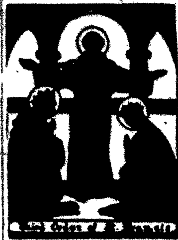
St. Francis de Sales