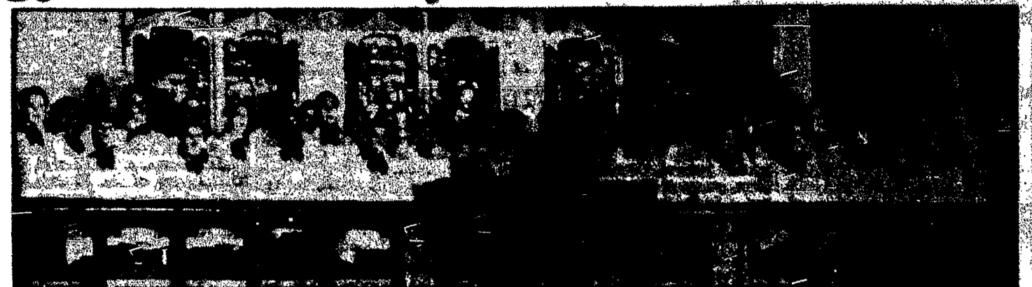
This select group of 55 voices from the 190 member choir of "Father Flanagan's" will be heard at the Eastman Theater Sunday, October 28 under the sponsorship of the Civic Music Association and the Diocesan Holy Name Union. They are shown in the Dowd Memorial Chapel at their "home."