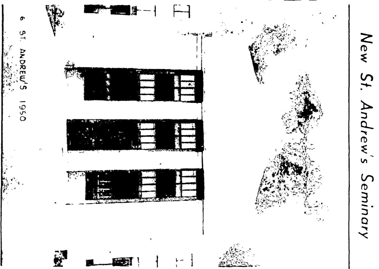
New St. Andrew's Seminary