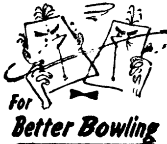
For Better Bowling