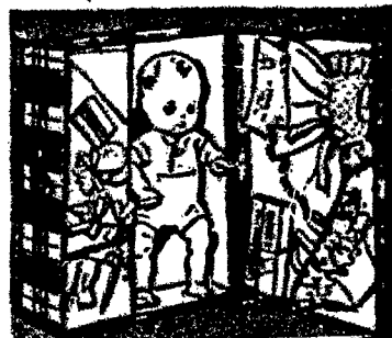
she has a complete layette all packed in travelling suitcase