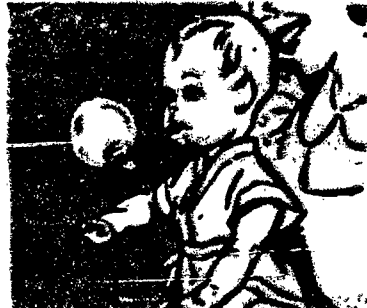
she blows bubbles from her food little bubble pipe