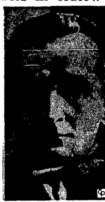
CARDINAL SAPIEDA Berlin — (NC) — The death on July 23 in Cracow of His Eminence Adam Cardinal Sapieda, Archbishop of Cracow, Poland, reported here reduces the Sacred College of Cardinals to 49, and removes from the scene the only Cardinal behind the Iron Curtain who had been still free to carry on his ministry. The Cardinal, Poland's only member in the Sacred College, had been in ill health for a long time and was 84 years old.