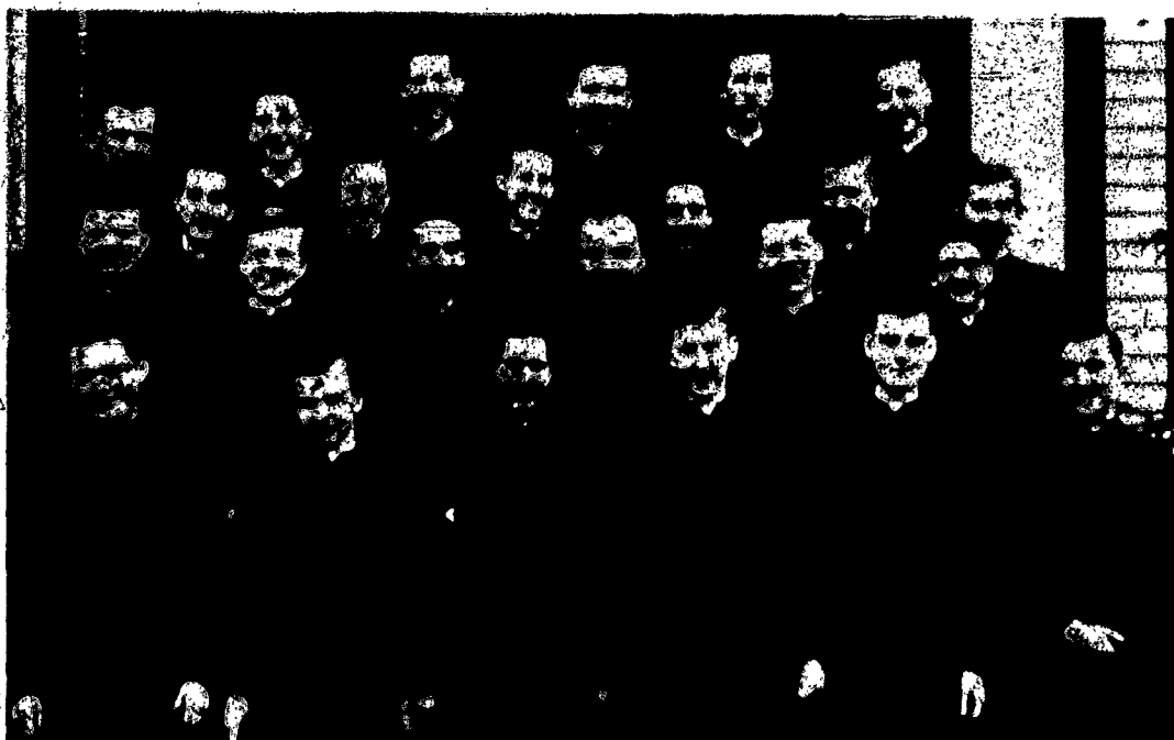
BASILIAN IN THE MAKING — This group of twenty-four young men are preparing to become members of the Basilian Fathers at St. Basil's Novitiate, Rochester. The Basilian Fathers conduct Aquinas Institute and St. John Fisher College in Rochester and other educational institutions in the United States and Canada.

Toronto Basilians In 1922 the Holy See separated the two provinces into distinct Congregations: the Congregation of Priests of St. Basil of Toronto, and the Congregation of Priests of St. Basil of the Diocese of Viviers. In America as in France the Congregation settled in the smaller centers of population. Consequently its growth was slow, no more than enough to staff existing schools and parishes and to make new found-