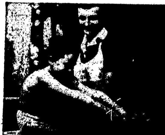
Courage comes easier when there's a visiting nurse to help. 12,886 Persons depend on her — on you!