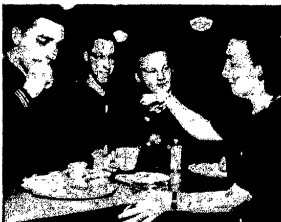
USO is back in USA and overseas. Your help makes all the difference to homesick men in uniform.