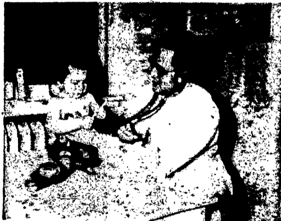
Red Feather Hospitals and Clinics care for the sick and build good health — with your help.