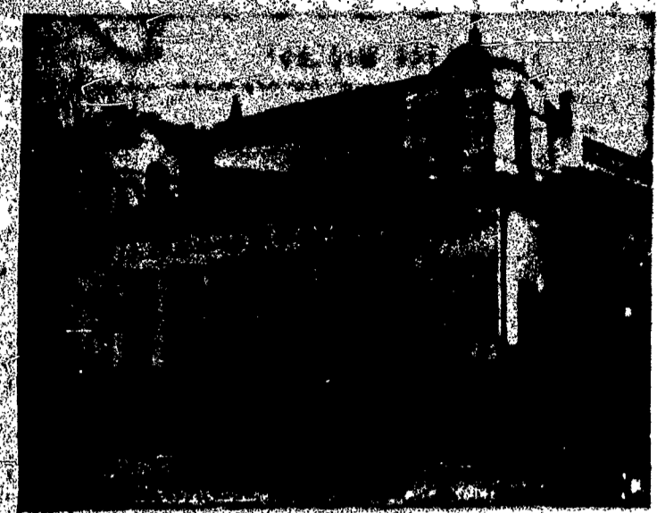
The Church of St. Louis of the French, only Catholic Church in Moscow. The city center of religious freedom in Soviet Russia. The city center of religious freedom in Soviet Russia. The city center of religious freedom in Soviet Russia.

The communist regime is reported to be becoming angrier over and impatient with the Catholic refusal to accept the "independence" or "three autonomous movements," as it is also called, the autonomies being ecclesiastical "self-rule, self-support and self-propagation."