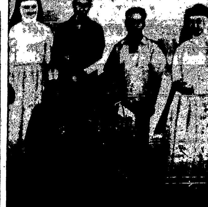
In the New Bilbid prison outside of Manila, Japanese prisoners of war, condemned for war crimes, are pictured following their baptism, with instructors, two Franciscan Missionaries of Mary.