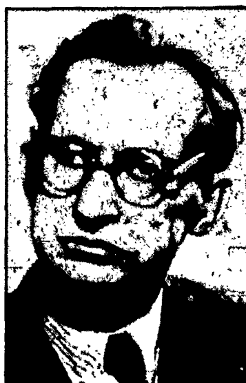
PREMIER DE GASPERI

"For Christians, then," he continued, "peace is not simply the absence of active, open war, but the spirit of human solidarity, the will for international cooperation, free discussion and under-