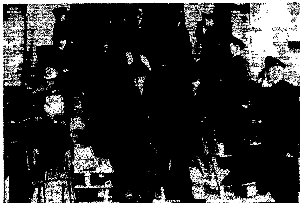
The body of Major Don Gentile, of Fiqua, Ohio, famed flying ace of World War II, and killed in a jet trainer crash in Maryland, is borne by his fellow officers in the U. S. Air Force.