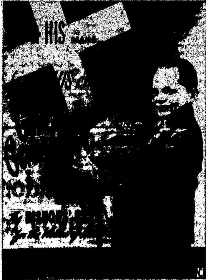
This striking poster will herald the 1951 children's drive in the annual Bishops' Campaign for the Victims of War. Some 2,000,000 youngsters in the Catholic schools of the United States will be asked to aid the needy in war-wrecked countries. The National Catholic Welfare Conference will open the campaign in a special broadcast from Rome on Ash Wednesday, February 7.