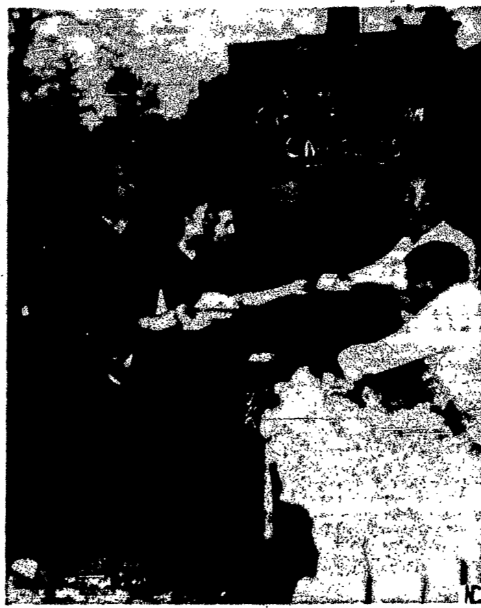
Every refugee in the Military Government camps in Trieste received his share of the 1,200 pounds of butter that was War Relief Services-N.C.W.C.'s Christmas gift. Moreover, the aged and infirm shared in a second gift of 400 food parcels distributed by this organization.