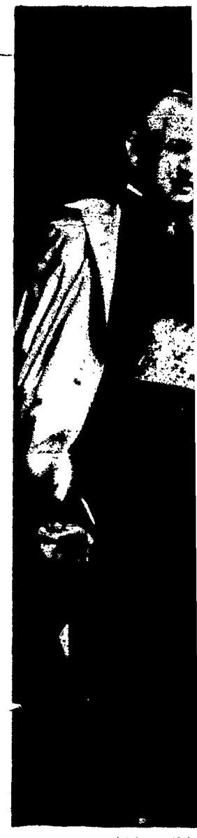
APOSTOLIC DELEGATE His Excellency Bishop