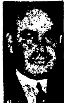
SEN. HERBERT H. LEHMAN