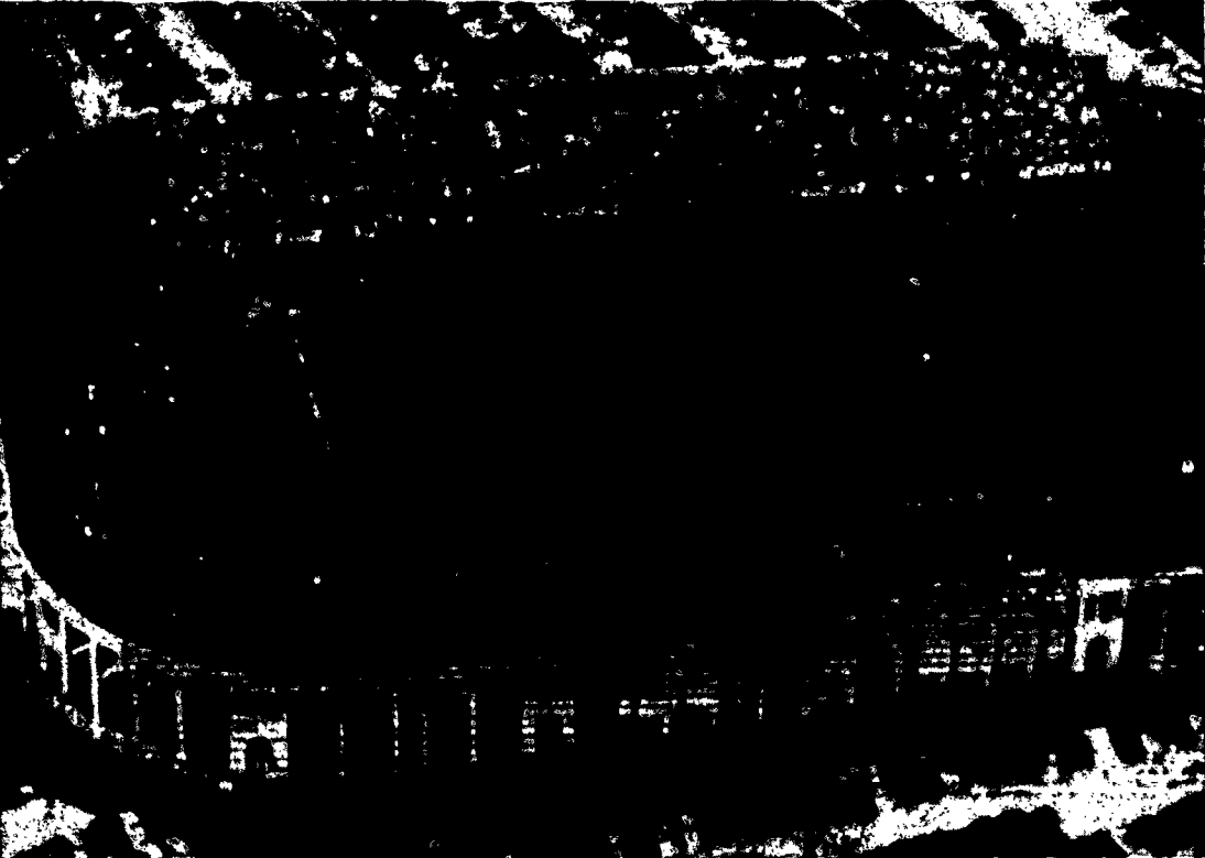
Aquinas Memorial Stadium will be setting for 'Hour of Prayer'