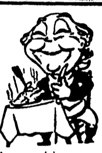
Approved by Duncan Hines

DINNER WITH THE BARON Pleasure — Hospitality — Good Food — COCKTAIL LOUNGE (air conditioned) Suppers served 'til midnight Baron Steuben CORNING, N. Y.