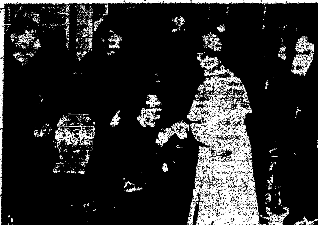
Six of the Catholic bishops affected by the recent decree establishing the hierarchy in British West Africa are shown as they were received by Pope Pius XII in Rome.