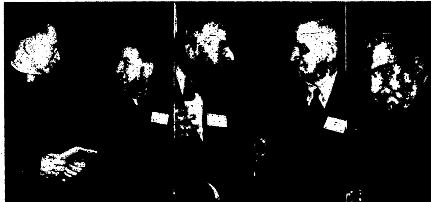
CATHOLIC PRESS GATHERING IN ROCHESTER

Bishop Ready advanced a proposal for a statewide or regional Catholic press, to complement the "unquestioned values in a Diocesan Press."