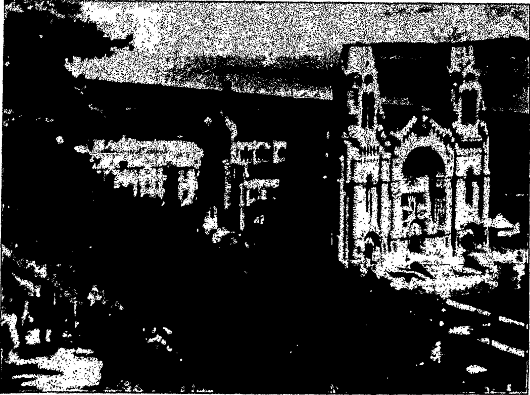
The beautiful Basilica of St. Anne de Beaupre, above, will be a point of pilgrimage for many from this area every Sunday from June 18 through September 17, according to American