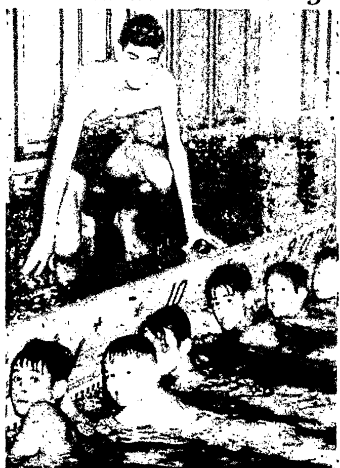
SWIMMING LESSON AT CYA POOL

The Columbus Youth Association (CYA) is a non-profit organization which is dedicated to the health and character building of the youth of the city. The organization was founded in 1914 and has since that time been a leading force in the community. The CYA is a member of the National Youth Conference and is affiliated with the National Youth Administration. The organization is supported by the city of Columbus and the State of Ohio. The CYA is a member of the National Youth Conference and is affiliated with the National Youth Administration. The organization is supported by the city of Columbus and the State of Ohio. The CYA is a member of the National Youth Conference and is affiliated with the National Youth Administration. The organization is supported by the city of Columbus and the State of Ohio.