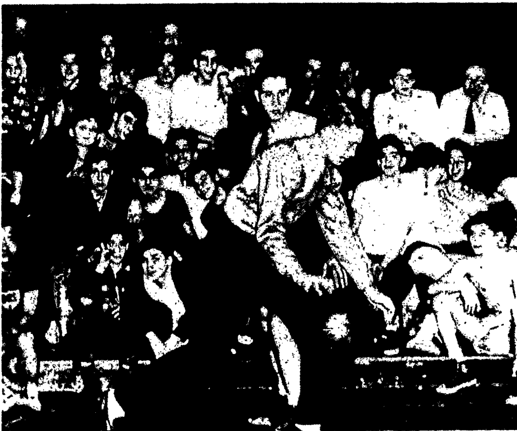
BOBBY DAVIES, ROYALS' STAR, GIVES SETTLEMENT BOYS A LESSON