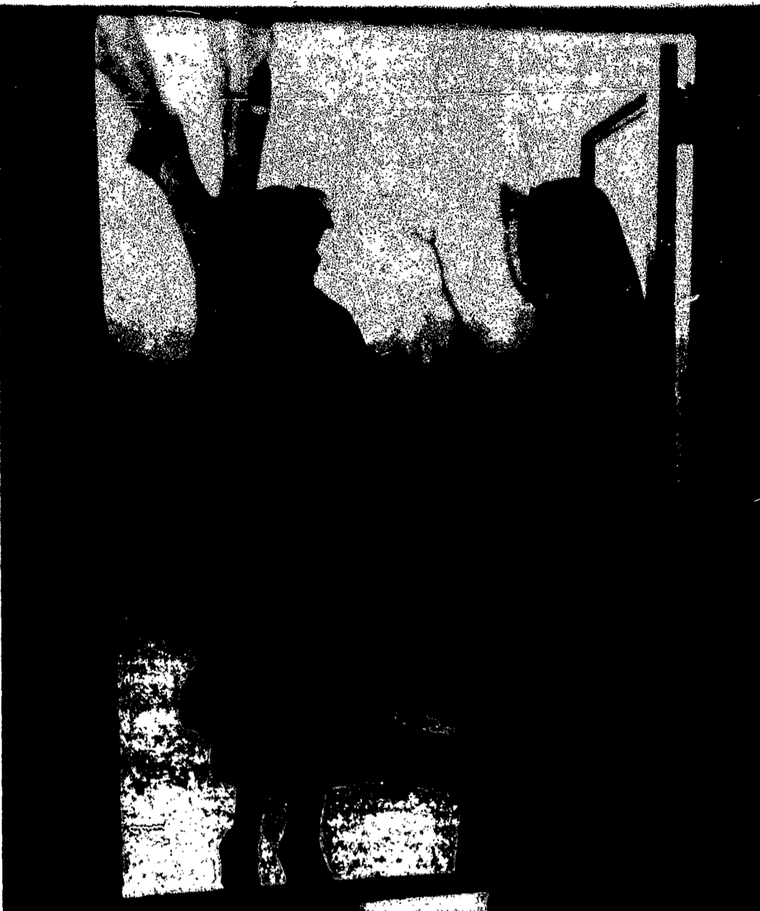
Cenacle Silhouette As twilight falls a retreatant rings the bell at the Bellgong of the Cenacle retreat house on East Avenue, Rochester, to enter for a weekend of prayer and devotion. The religious in charge of the Cenacle

Women from all stations of life—professional women, housewives, mothers and women of