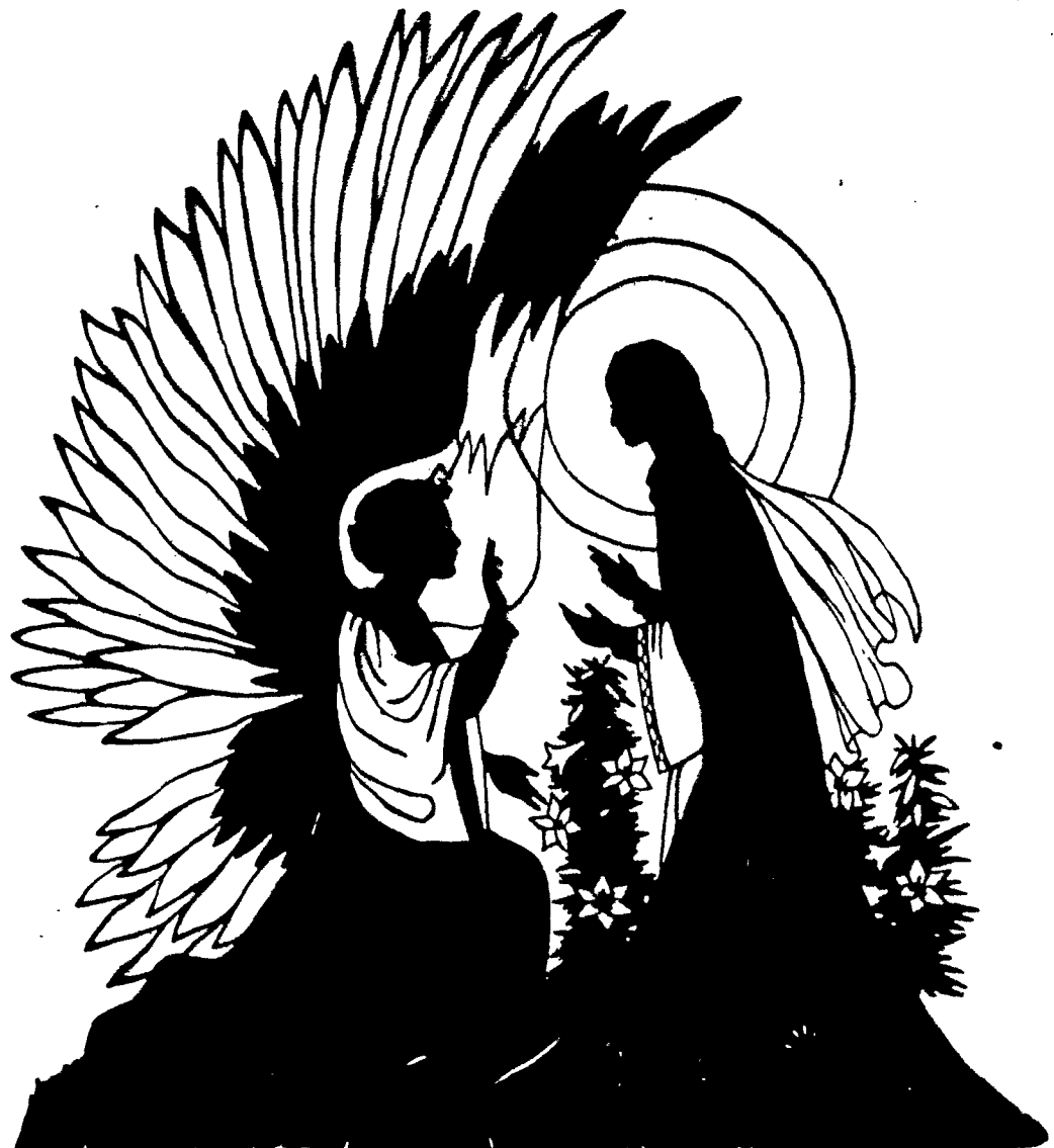
'He Is Risen!'

STORY OF THE RESURRECTION ACCORDING TO ST. MARK