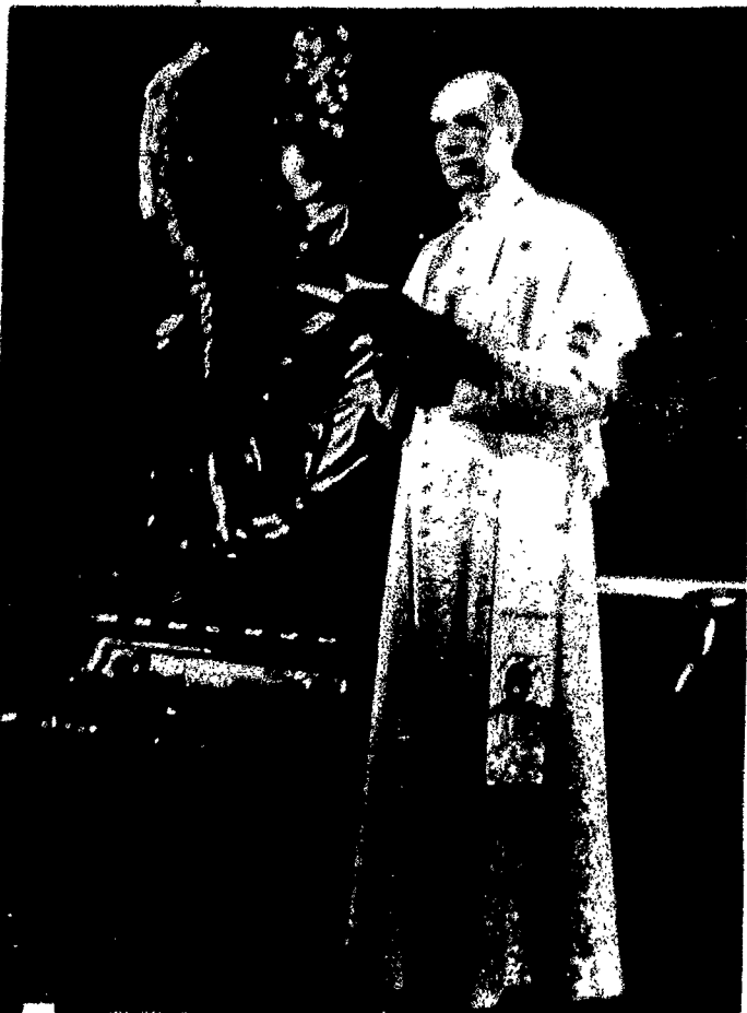
Photographed in the historic Conclistoria Room of the Vatican as he was delivering a Lenten Sunday message for the American television audience, His Holiness Pope Pius XII made the special appeal on behalf of the 1950 Holy Year of the Bishop's Fund for the Victims of War. A million picture film was made on that occasion and flown to the United States in time to be televised on stations throughout the country.