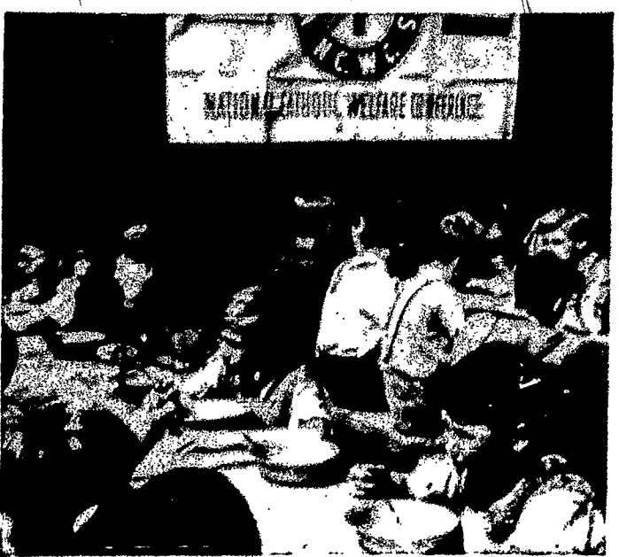
Hungry school children, like boys pictured here at a school in Germany, will benefit by relief program of the Bishop's Fund for Victims of War...