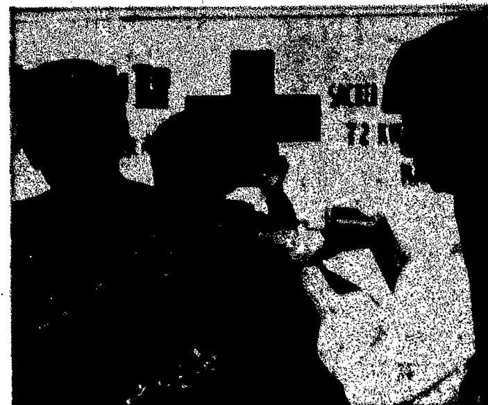
Typical of the many relief services for the victims of war in many parts of the world are the mobile clinics operated by medical missionaries and Catholic welfare aides. From China comes this photo of a Franciscan Missionary of Mary administering a vaccine to a child held in the arms of his mother. This work will be financed in part by the Bishops' Fund for the Victims of War.