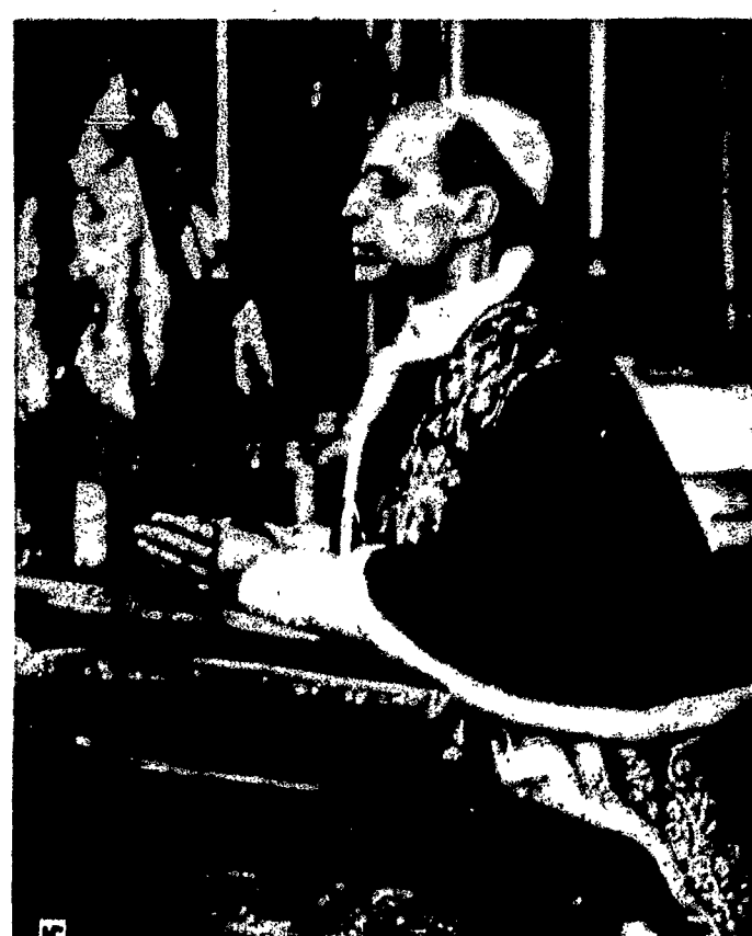
His Holiness Pope Pius XII is shown reciting the Holy Rosary. From time to time during the Holy Year, visiting pilgrims in St. Peter's Basilica may have the privilege of participating in the recitation of the Holy Rosary, under the leadership of the Holy Father.

The whole and entire body of Catholic doctrine is therefore to be proposed and explained. Nothing embraced in the Catholic truth concerning the true nature and means of justification, the constitution of the Church, the Roman Pontiff's primacy of jurisdiction and the only true Church of Christ must be passed over in silence or cloaked under ambiguous language.