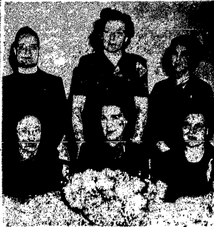
Officers of Auburn Chapter, National Council of Catholic Nurses elected at a dinner meeting in Osborne Hotel, Auburn, pose for their picture.