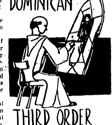
DOMINICAN THIRD ORDER