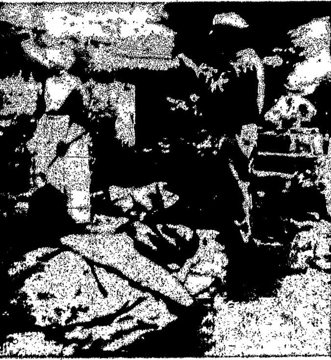
Injured are tended outdoors at Ambato, Ecuador, so great is earthquake devastation. The scene is outside a Catholic hospital. A nun moves about aiding injured while a flyer of the Quito-Ambato airlift takes down the names of victims.