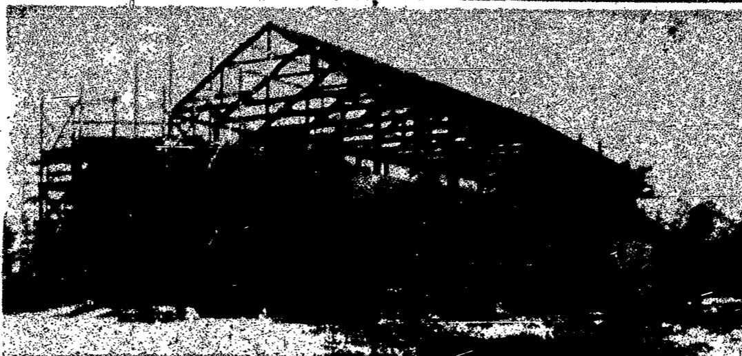
St. Margaret Mary's new church, slowly rising on Rogers Parkway, in Tonawanda, Rochester suburb, will soon be one of the largest in the diocese with seats for 1,200 people. The half-finished walls are buff tapestry brick faced on the interior with special grey stone. Special features of the decoration will be 14 stained-glass windows honoring the Apostles, and a giant rose-window over the choir. The new rectory (right) will be completed by Sept. 1, but material shortages may delay the church's completion until after Jan. 1.

Romney (RNS) — First Roman Catholic to hold a cabinet post in independent India is J. L. P. Roche, Victoria, Madras business man who has been named Minister of Food and Fisheries. A member of the Madras Legislative Assembly since 1937, he won his seat on the Provincial Legislative Council in 1946 on the Congress ticket. Minister Roche, Victoria is also a member of the Advisory Committee of the Constituent Assembly.