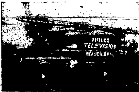
Below are but a few of the fleet of Philco dealer-contractor trucks and experts on television serving this vicinity.

This mobile Beaucaire-Philco Survey Unit, with collapsible 50 ft. antenna, tests television reception conditions — especially important in "fringe" areas.