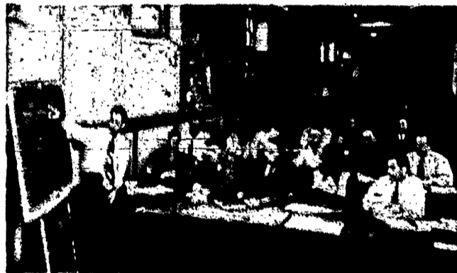
One of the Beaucaire-Philco Television Classes in Rochester. Each man received 80 hours of intensive television training.

* Beaucaire, Inc., for 27 years a leader in appliance distributing, has conducted a series of Philco Television Training Schools. Eighty Rochester and vicinity radio men have attended classes and laboratory sessions five days a week for four weeks. These men know television—they can assure you finest home enjoyment.