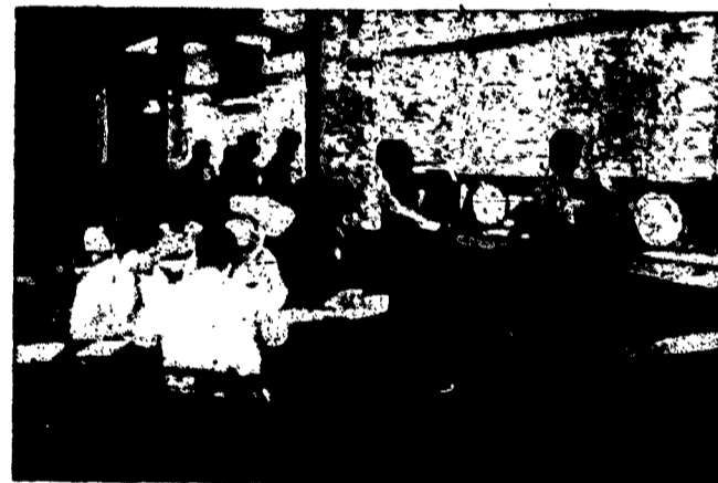
Television "know-how" is gained at the laboratory benches of the Philco-Beaucaire Television Training School in Rochester.

Special surveying, testing, installation and service equipment, costing many thousands of dollars, has been set up in Rochester for you — another reason why PHILCO dealers and contractors say, "In television — as in radio, refrigeration and air conditioning — invest in PHILCO, the LEADER!"