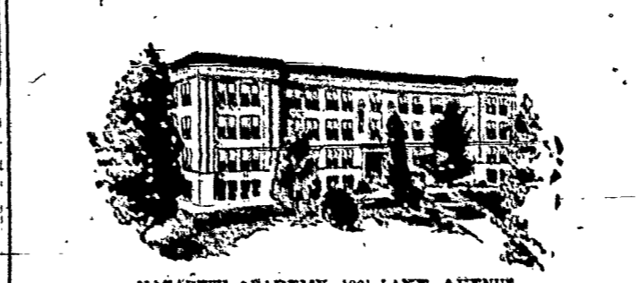
NAZARETH ACADEMY, 1001 LAKE AVENUE