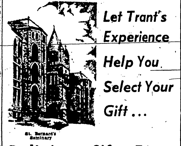
St. Bernard's Seminary