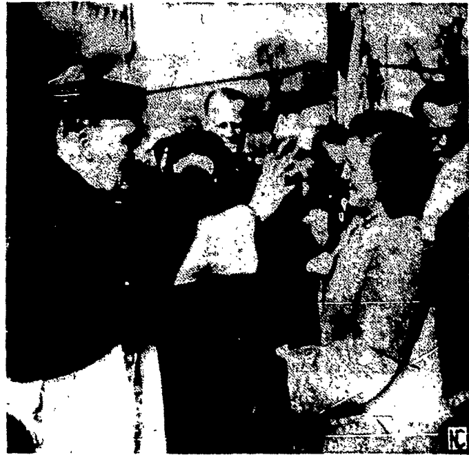
Cardinal Von Faulhaber, Archbishop of Munich, blesses a young refugee in the refugee camp at Mossburg, near Munich, following ceremonies laying the first stone for a new church there. The construction of the church was made possible by funds sent from America to Pope Pius XII.