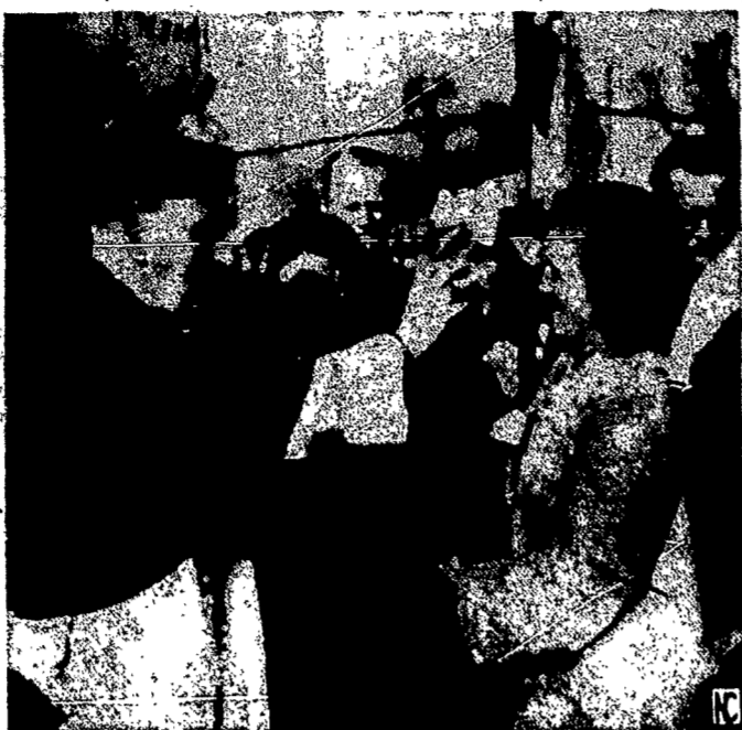
Cardinal Von Faulhaber, Archbishop of Munich, blesses a young refugee in the refugee-camp at Munsburg, near Munich, following ceremonies laying the first stone for a new church there. The construction of the church was made possible by funds sent from America to Pope Pius XII.