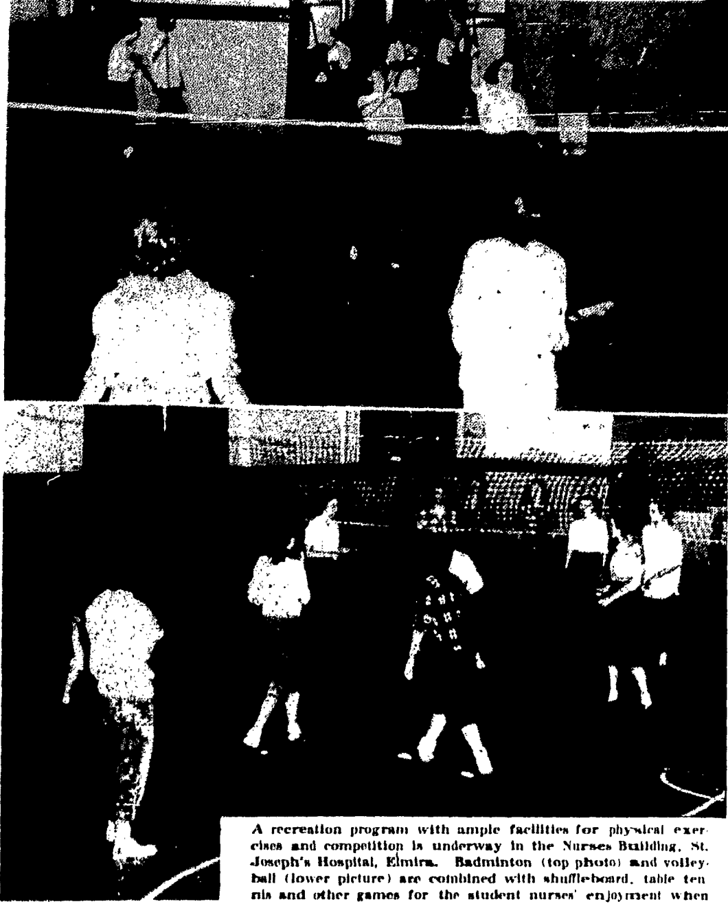
A recreation program with ample facilities for physical exercises and competition is underway in the Nurses Building, St. Joseph's Hospital, Elmira. Badminton (top photo) and volleyball (lower picture) are combined with shuffleboard, table tennis and other games for the student nurses' enjoyment when off duty.