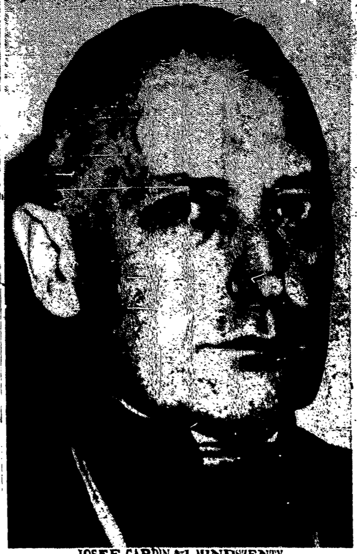
JOSEF CARDINAL MINDSZENTY