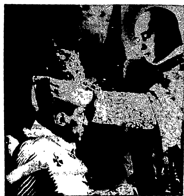
His Holiness Pope Pius XII, 73 years old on March 2, will celebrate the tenth anniversary of his coronation as Pope, March 12, completing a decade that was among the most eventful in all history. The Holy Father is shown (left)