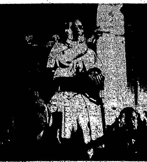
at the moment of his solemn coronation, in 1939; carried aloft on the gestatorial chair (right) during one of many public audiences accorded service men during the war, and (center) as he appears today.