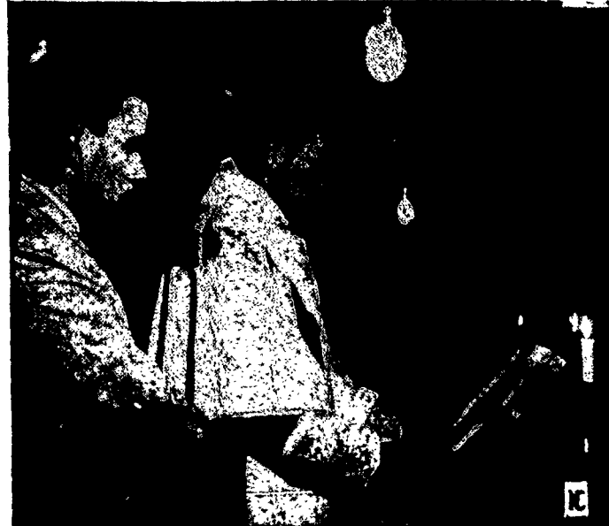
Archbishop Gustavo Testa, Apostolic Delegate to Palestine (upper photo), distributes subsidies to heads of poor refugee families and coins to little children to aid the sad plight of the thousands of refugees and displaced persons in the Holy Land. Father Hughes of the Franciscan Church in Jaffa, celebrates Mass in a P.O.W. camp somewhere in Israel (lower photo).