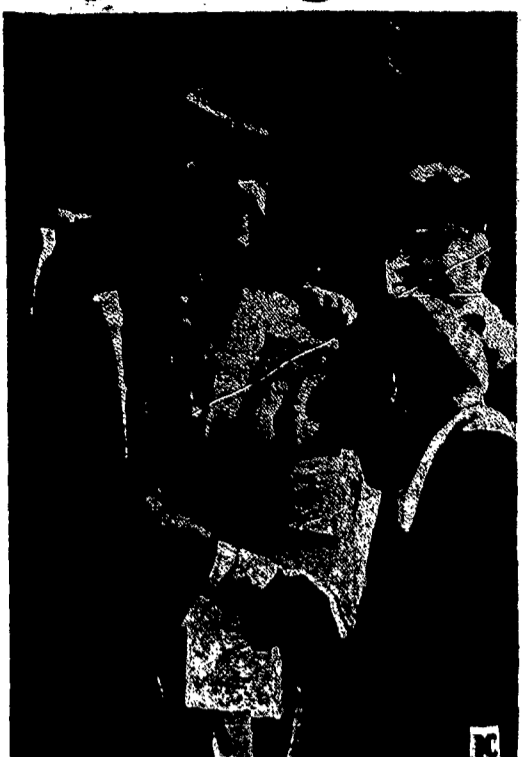
At Cali, California, Holy Father's Legate, Cardinal Domenico Sívora, was greeted (left photo) by Mayor Gustavo Lloreda. He presented him with key to the city, and received in turn an autographed photo of Pope Pius XII. Some of the 20,000 children who made their first Communion during the Bolivarian Eucharistic Congress there are shown grouped around main outdoor altar.